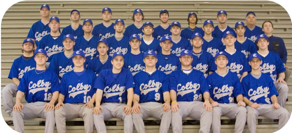
The 2009 Mules