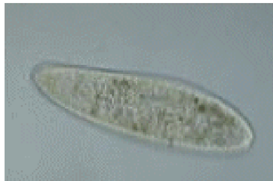
Protozoa (Paramecium)

Protists is a general term for unicellular eukaryotes. There are currently a number of different groups of protists, although the phylogeny of these organisms is still under revision. As would be expected, protists are a very diverse group (if they are really even a group at all). They are often placed into three categories based on their method of obtaining energy. Fungus-like protists absorb food from their surroundings. Plant-like protists (algae) are photosynthetic. And animal-like protists (protozoa) engulf food particles (i.e. "eat").