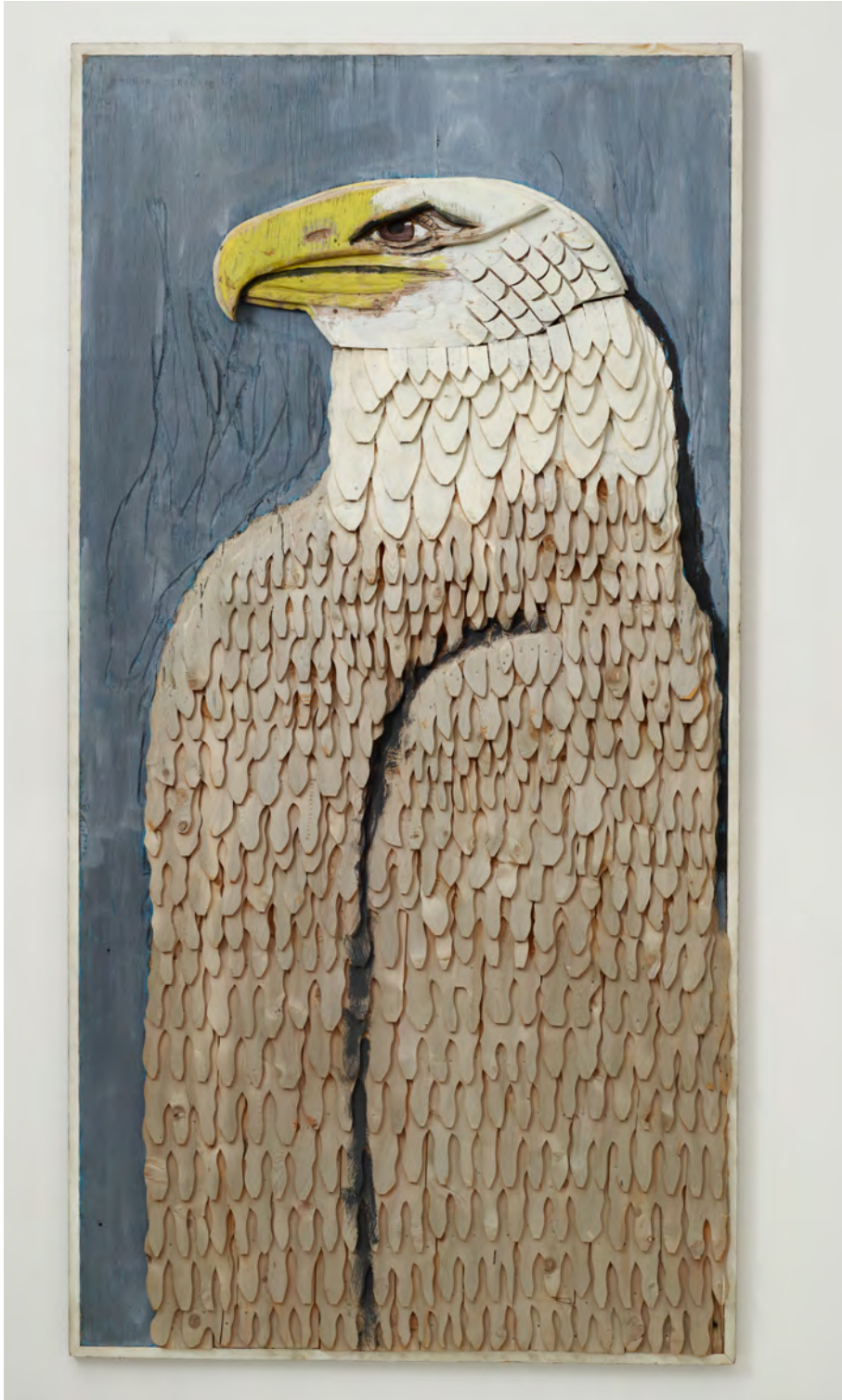
Eagle (ca. 1964), wood and painted wood.

Please note that this work of art may not be on display in the museum.