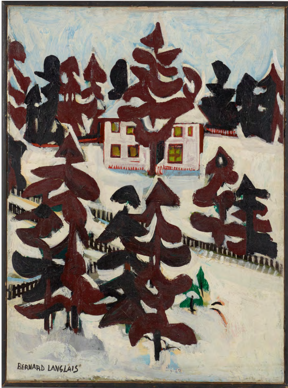
Winter in Oslo (1954-55), oil on canvas.

Please note that this work of art may not be on display in the museum.