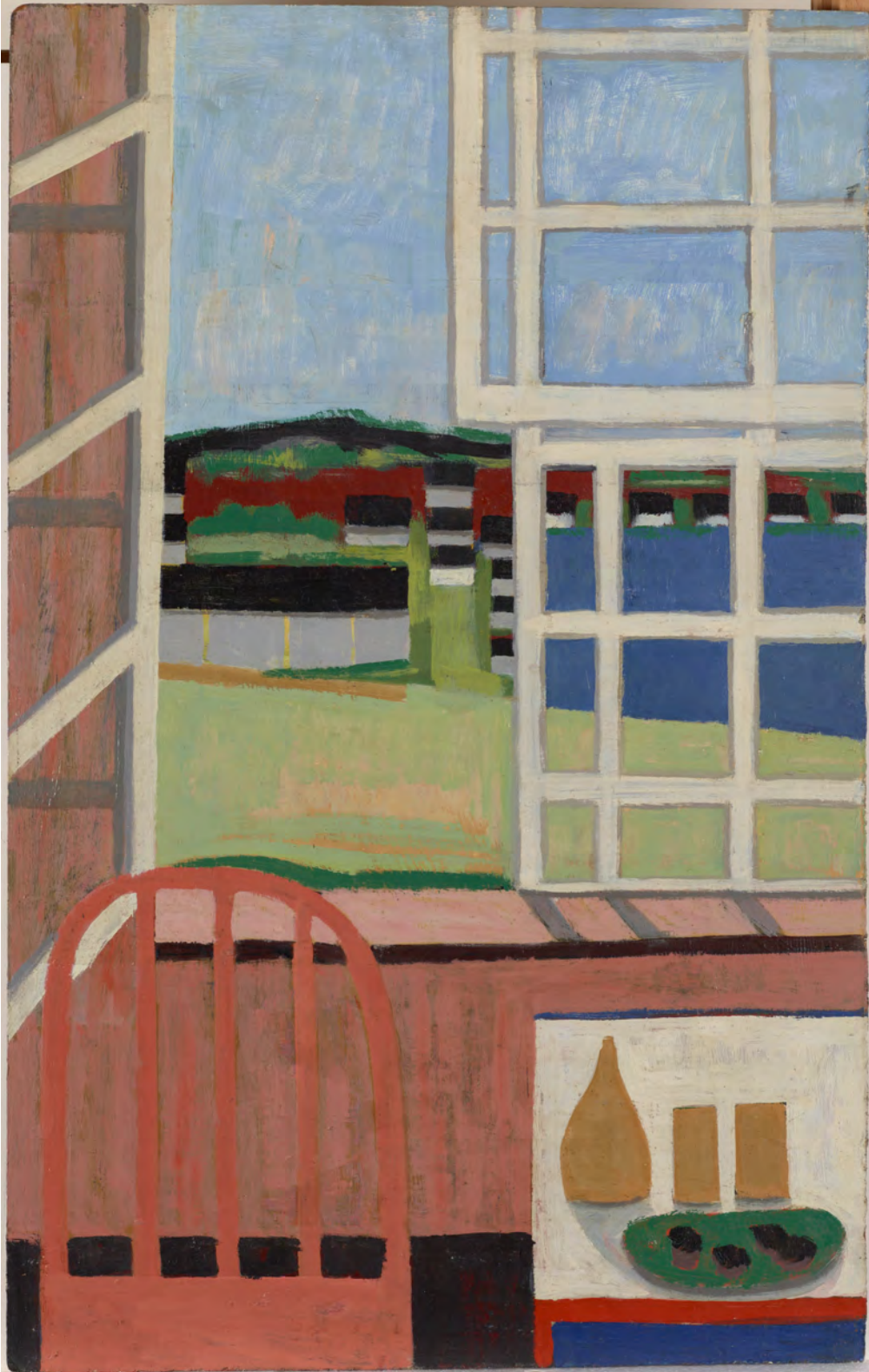
Untitled (Still Life, Landscape) (early 1950s), oil on Masonite.

Please note that this work of art may not be on display in the museum.