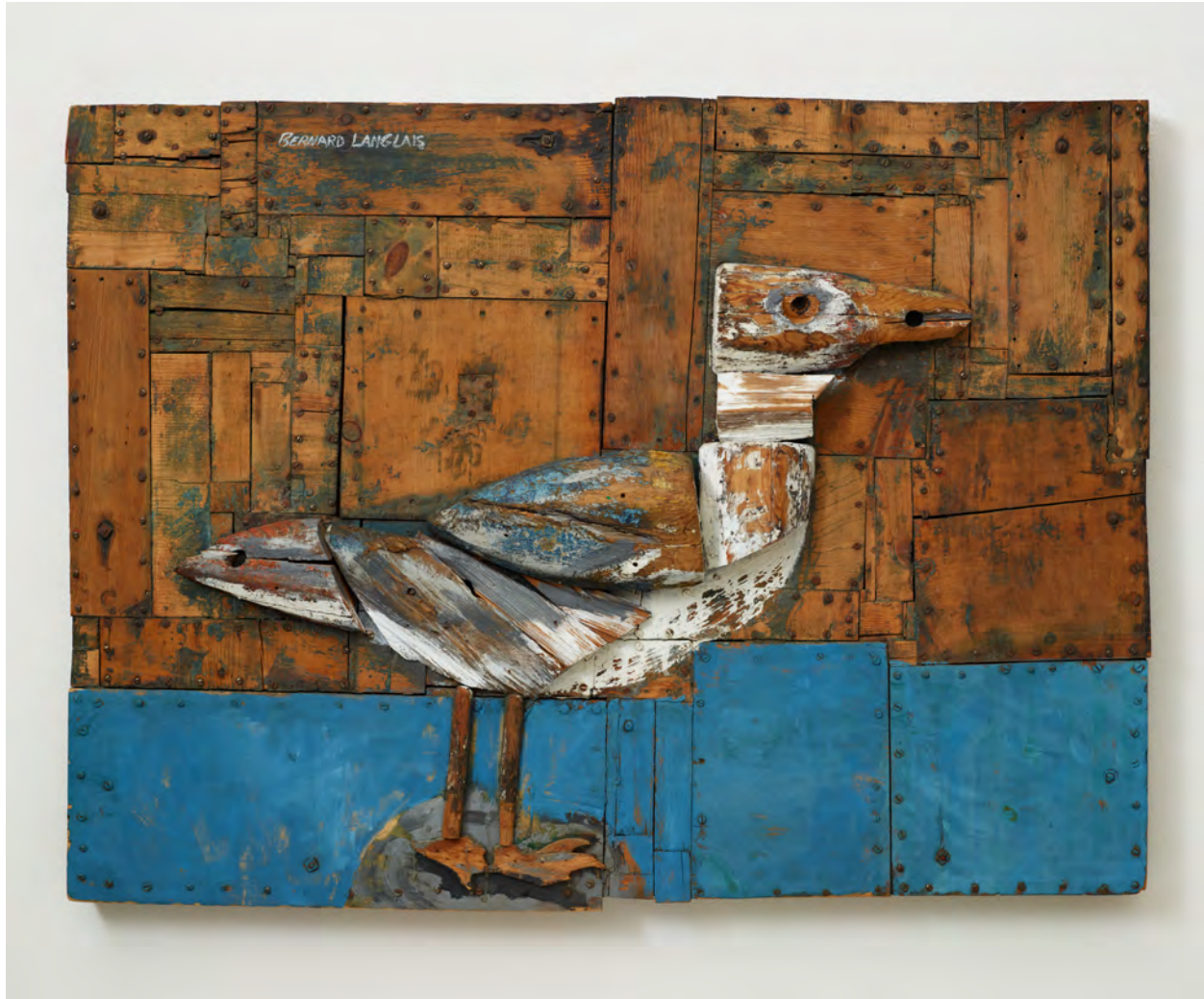
Monitor or the Merrimack (Gull on Pile) (1961), raw and painted wood, screws.

Please note that this work of art may not be on display in the museum.