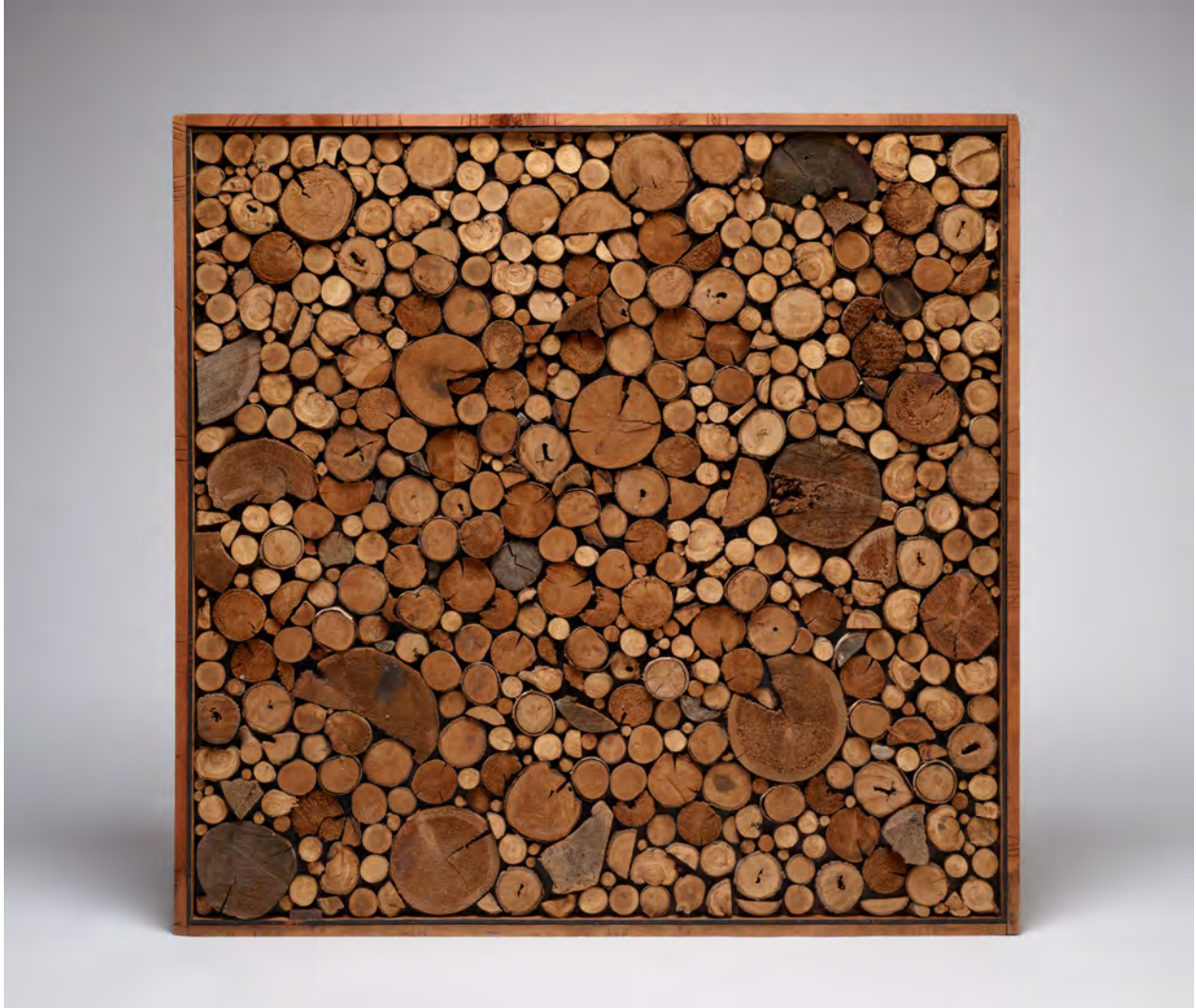
Behind the Barn Door (1960), raw wood.

Please note that this work of art may not be on display in the museum.