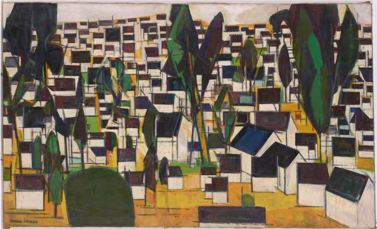
The Town (The White City) (1956-57), oil on canvas.

Please note that this work of art may not be on display in the museum.