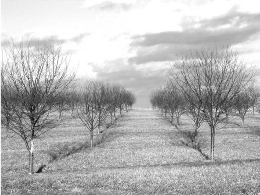
FIGURE 1 A naturalistic example of the depth cue of height-in-the-picture-plane. Objects closer to the horizon are perceived as being farther away.

lines converge with distance (linear perspective), surfaces that cover other surfaces are closer (interposition), and object sizes remain constant (familiar size). For height-in-the-picture-plane as depicted in Figure 1, infants need to perceive an object relative to the horizon and finding the horizon may not be particularly difficult if one perceives the ground plane. Thus, it is possible that sensitivity to height-in-the-picture-plane might emerge earlier than other pictorial depth cues.